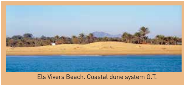
Els Vivers Beach. Coastal dune system G.T.

We can accommodate up to 5,000 people in cozy traditional pensions, small and larger hotels, apartments or a 5-star camping site with bungalows near the river's mouth.