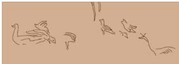
A drawing of green birds at the Muslim Ribat of La Fonteta , 10th c. AD taken from M a Jesús Rubiera Mata, Universitat d'Alacant.

Historically an area of fishing and farming—activities still pretty much alive—Guardamar translates as “Sea Lookout”. Archaeologists have found long tunnel nests of European bee-eaters ( Merops apiasters ) on the sandy bank walls of La Fonteta ; an 8th century BC Phoenician colony next to the River Segura's mouth. On that same site, green colour drawings of birds under a palm tree have been found on a lime plaster wall of the 10th century AD Ribat or Islamic retreat monastery, hidden under the sands for a thousand years. These pictograms include blue herons ( Ardeo purpurea ), mallards ( Anas platyrhynchos ) and other small birds.