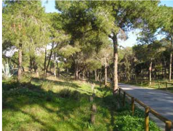
Guardamar dune pine forest G.T.

Guardamar is a small district of 22 square miles and 17,000 inhabitants in the low seasons and is right in the middle of it all. It is a Mediterranean resort, 30 minutes south of Alicante International Airport with a large 2,500-acre coastal dune-pine forest abutting a 6-mile long beach of white sand to the north and south of the River Segura, which is 202 miles long from its source in southern Spain. Almost 80% of the district is made up of protected woodlands, sand dunes and traditional irrigation and dry farming lands.