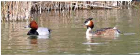
Common pochard ( Aythya ferina) and Great crested grebe ( Podiceps cristatus)