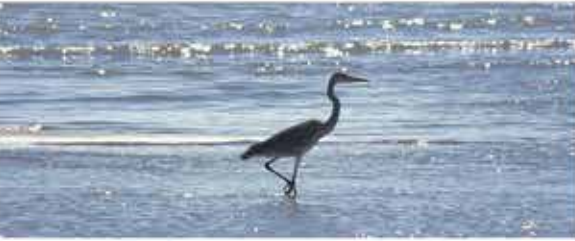
Grey heron ( Ardea cinerea ) at Els Tossals Beach in Guardamar. P.G.