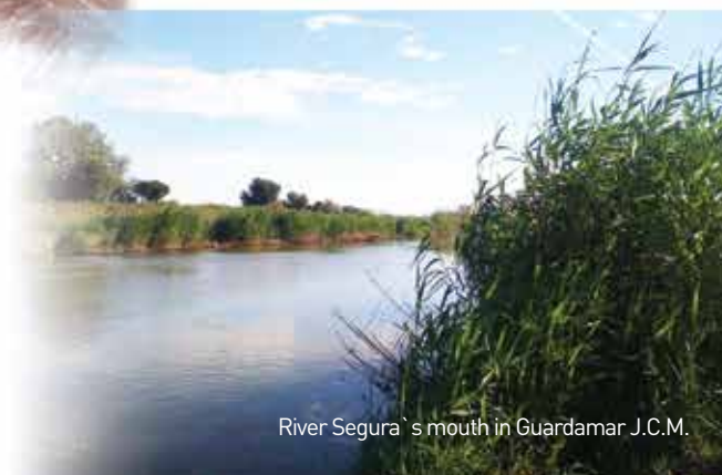
River Segura's mouth in Guardamar J.C.M.