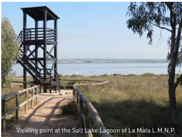
Viewing point at the Salt Lake Lagoon of La Mata L.M.N.P.

Birders familiar with the Spanish Mediterranean coast may remember the names of bird havens such as El Fondo Reservoir in Elx-Crevillent, the Santa Pola Salt Pans, the Mouth of the River Segura in Guardamar or the Salt Lake Lagoons of la Mata and Torrevieja, all within a 15 minute drive from your accommodation in Guardamar.