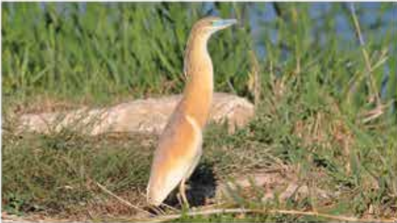
Squacco heron ( Ardeola ralloides ) V.S.