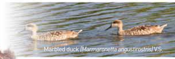
Marbled duck ( Marmaronetta angustirostris ) V.S.