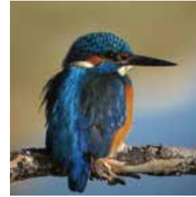
Kingfisher ( Alcedo atthis) at River Segura's Mouth

The town offers both a traditional small Spanish town and international atmosphere unique in the region.