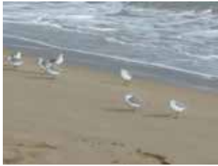
Sanderlings ( Calidris alba ) at Les Ortigues Beach in Guardamar J.C.M.

If you are a bird lover, whether an enthusiastic amateur or a seasoned pro, Guardamar and the surrounding area of the Southern Costa Blanca offers a wide variety of species uncommon elsewhere along with some more common ones. There is an abundance of birdlife that would impress any European birder. Migratory periods in spring and autumn will, of course, bring in many water birds. Seawatchers have a plus at our river's pier, coastal dunes, beaches and neighbouring hills, where they can catch a glimpse of a bird list too long to mention in a short presentation.