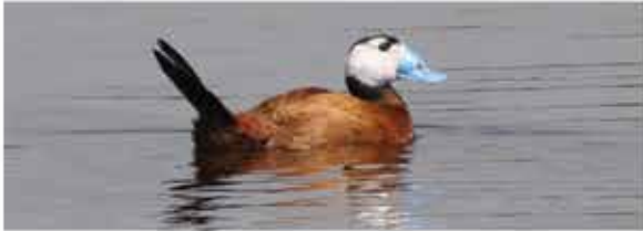
White-headed duck ( Oxyura leucocephala ) V.S.