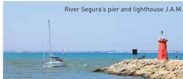
River Segura's pier and lighthouse J.A.M.